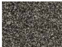
▲ SB: PBH.0810 | 400 & 500 cm