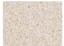
▲ SB: PBH.0420 | 400 & 500 cm