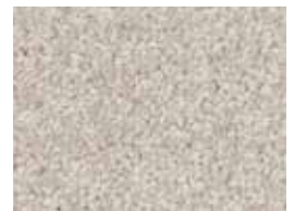
▲ SB: PBH.0873 | 400 & 500 cm