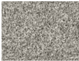
▲ SB: PBH.0870 | 400 & 500 cm