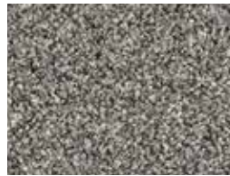
▲ SB: PBH.0840 | 400 & 500 cm