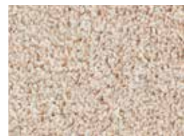
▲ SB: PBH.0250 | 400 & 500 cm