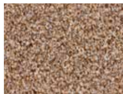
▲ SB: PBH.0220 | 400 & 500 cm