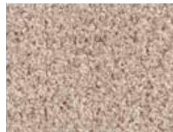
▲ SB: PBH.0421 | 400 & 500 cm