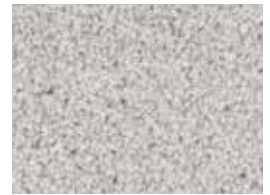
▲ SB: PBH.0880 | 400 & 500 cm