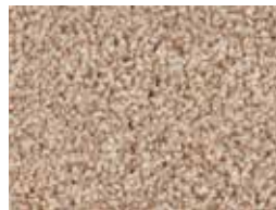
▲ SB: PBH.0260 | 400 & 500 cm