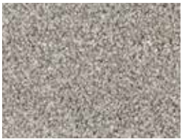
▲ SB: PBH.0860 | 400 & 500 cm